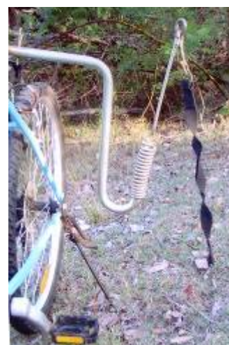
Springer™ bike attachment

The Springer™ comes with a lead attachment that is designed to break free if there is a hard pull or jolt on the lead. As most of my bike work must be done on the highway, I'm not happy with the idea of my dogs getting loose for any reason. My solution has been to have my dogs wear martingale collars that they can't pull out of and attach them to the springer with an elastic lead. The stretch in the elastic lead combined with the flexibility of the Springer™ ensures my dogs stay safely on lead at all times but without the risk of getting a severe jerk on their neck if they stop suddenly. Using a Springer™, during one ET preparation I regularly ran three German Shepherds together from my bike without ever feeling unsafe. I love my Springer™!!