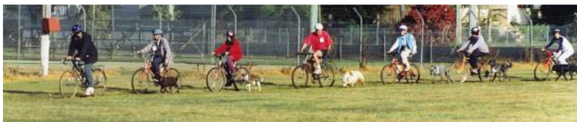
Competitors at a Grafton Dog Obedience Club Endurance Test

Tests are usually only held in winter and are run early in the morning to avoid the risk of heat stress to the dogs.