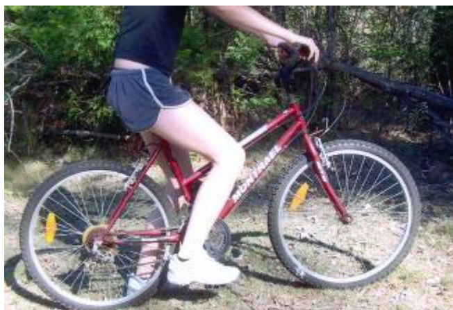
This bike is too small and the seat is too low for this rider

A reflective vest is also good life insurance if you ride in the dark (you can also get reflective vests for dogs)!