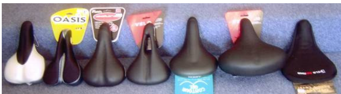
A selection of comfortable bike seats and a gel pad seat cover.

Get a comfortable seat for your bike. You should choose the seat that is most comfortable for you as everyone is different. There are many different seats available including gel seats for extra comfort. Gel or fleecy seat covers for existing seats are also available.