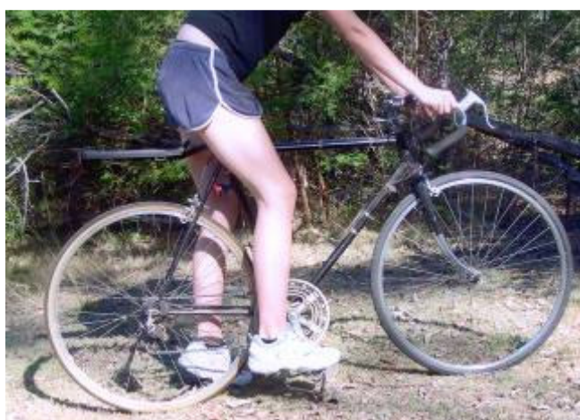
This bike is the right size and the seat is the correct height for the rider

A speedometer is a useful piece of equipment. With a speedo fitted to your bike you will be able to vary your speed and know for sure what speed you are riding at. You can then practice riding at the various speeds you may need to ride during the test. Most speedos for bikes measure speed, total distance travelled, and trip distance.